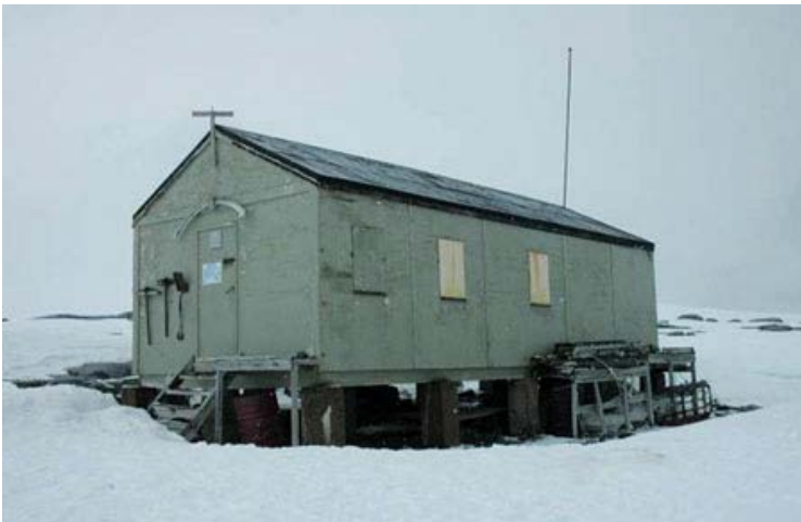
Damoy Hut (UK), Historic Site and Monument No 84