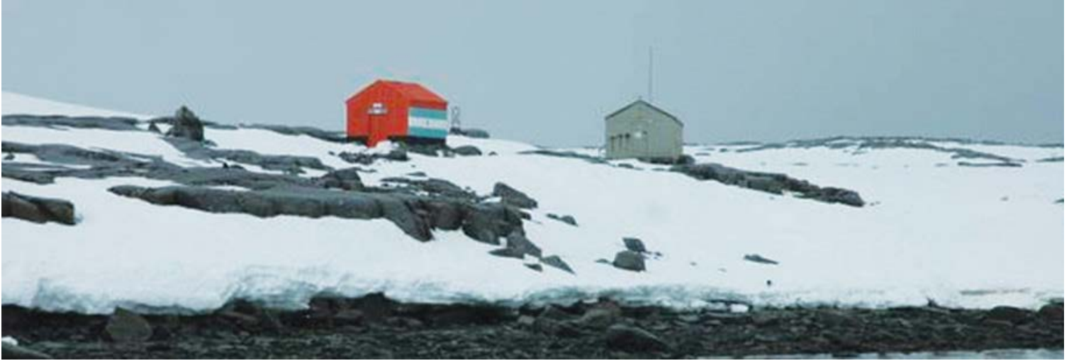
Shoreline of Dorian Bay showing the preferred landing site and the Argentine and UK huts in the background