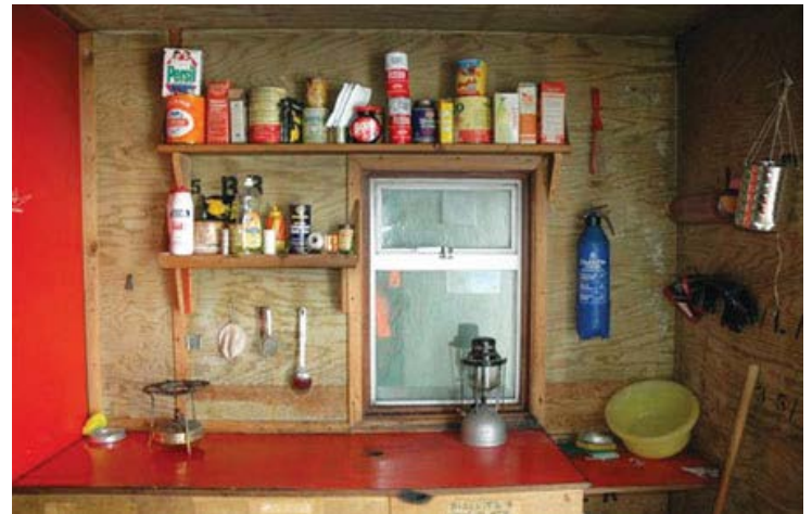
Interior of Damoy Hut Historic Site and Monument No 84