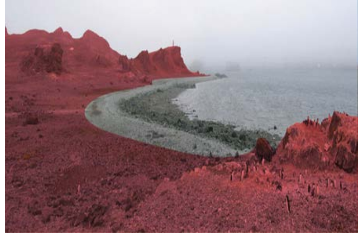
View to the site from South of Brailard Point, eastern area of the Northeast beach in Ardley Peninsula (Ardley Island). Entry into the ASPA (red area) is prohibited without a permit.