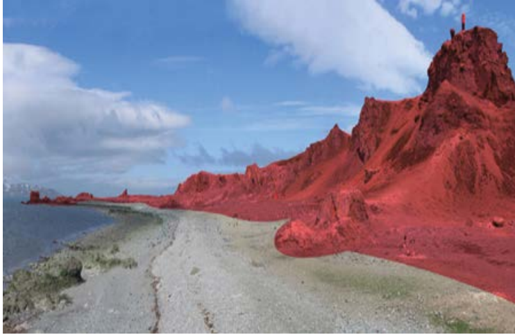
View to the site from Faro Point, the landing point to visit this site. Entry into the ASPA (red area) is prohibited without a permit.