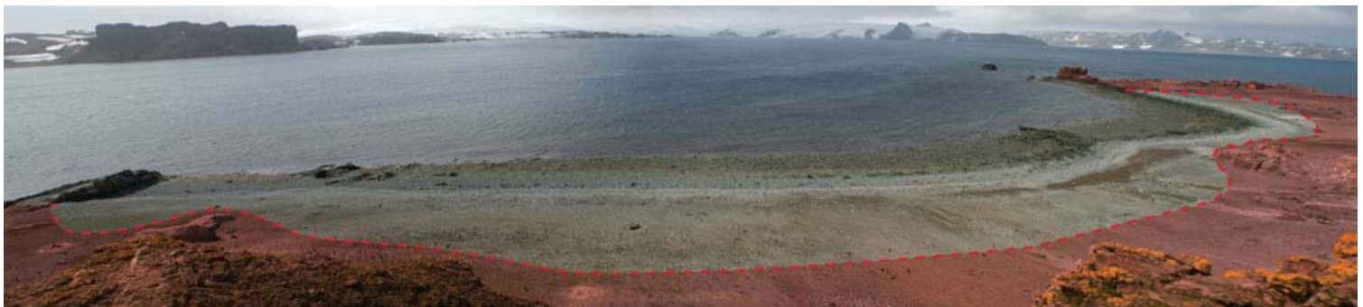
View to the site from Faro Hill. Entry into the ASPA (red area) is prohibited without a permit.