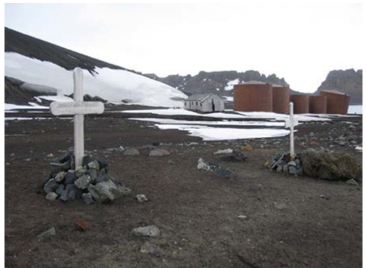
Details from the cemetery in front, and remains of hunting lodge and fuel tanks in the back.