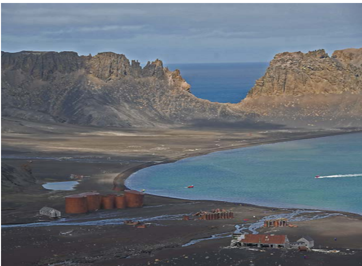
Overview of Whalers Bay visitor site with Neptunes Window in the background.